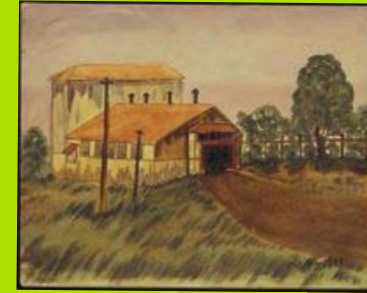
Joe Rootsey: Queensland Aboriginal Painter 1918–63 This retrospective exhibition celebrates the art of Joe Alimindjin Rootsey, one of the first Indigenous people in Queensland to be recog- nised as a contemporary artist.