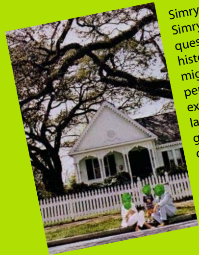
Simryn Gill: "Gathering" Simryn's work considers questions of place and history, and how they might intersect with personal and collective experience. Using objects, language, and photo- graphs, she conveys a deep interest in material culture, and in the ways that meaning can transform and translate into different contexts.